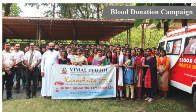
Blood Donation Campaign