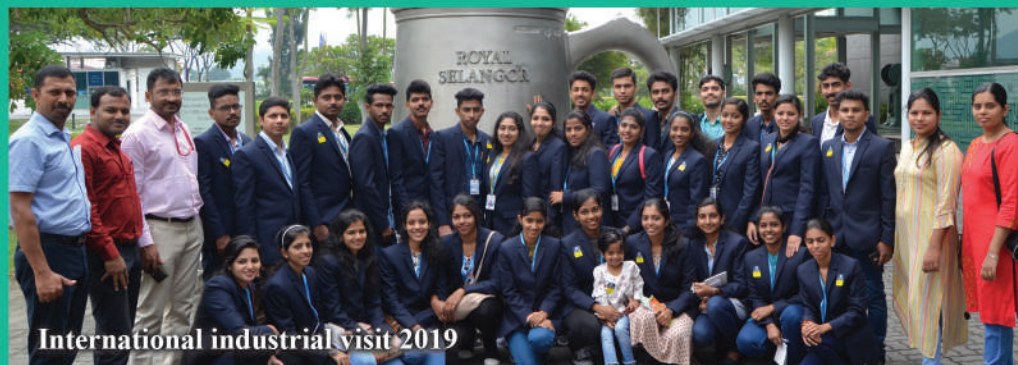
International industrial visit 2019